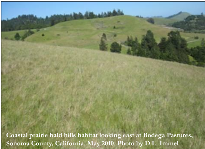
Coastal prairie bald hills habitat looking east at Bodega Pastures, Sonoma County, California. May 2010.