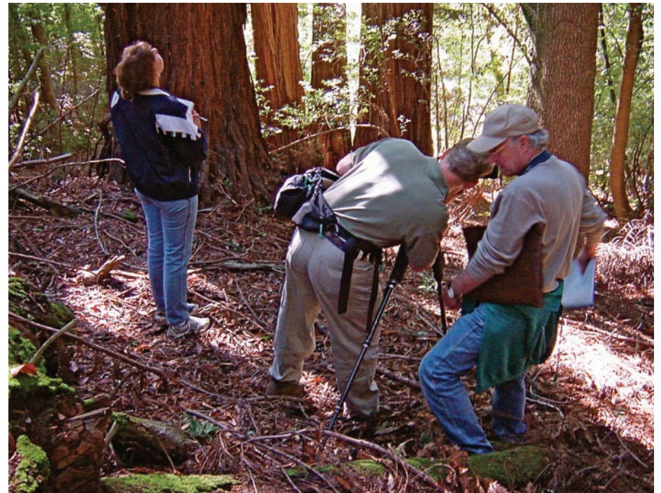
Abigail Myers, Jerry Dodrill and Sandy Sharp conduct an annual monitoring visit. Rob Cary

We encourage all landowners in our area to consider conservation easements on their property, because just about all the land in our area has important conservation value! All our existing easements protect riparian and wildlife habitat, but we also work to encourage the preservation of agriculture and agricultural land. We seek easements that provide linking corridors for wildlife movement, protect coastal prairie and forest ecosystems, and preserve the beautiful scenic views we all love so well.