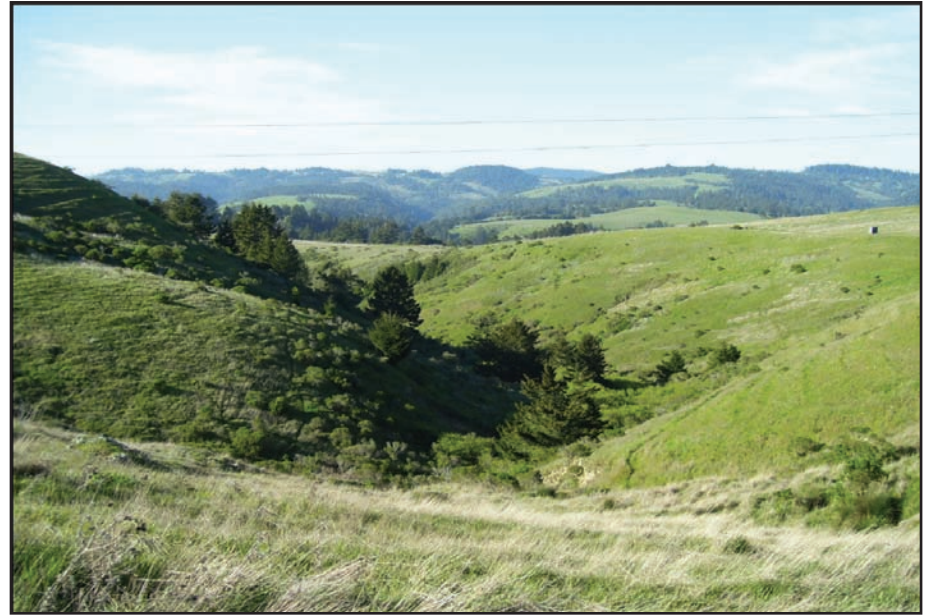
Magnificent views from Bay Hill Road make it one of West Sonoma County's most treasured back roads. Joe Mortenson

Coastal Prairie and Forests. The coastal prairie and coastal mist forests found in western Sonoma County constitute rare, threatened and important ecosystems in California. Both support great biodiversity. Much of the coastal prairie is currently utilized for agriculture. Private, non-industrial landowners own over 65% of the forestland. A number of factors including population growth, regulations and changes in the economy are creating pressure to convert forests and prairie to other uses. Ensuring the continuity of these forests and prairies will allow for their continued good health and habitat value. Bodega Land Trust works with various groups to identify large and small properties for protection that link habitat, pastures, forests, and nearby protected land. Appropriate grazing protective of the coastal prairie ecosystem is supported via agricultural easements.