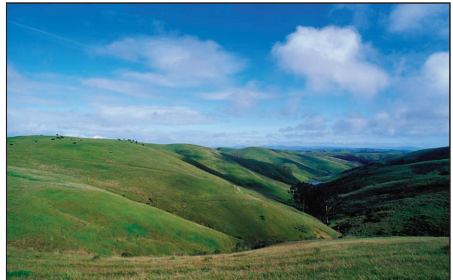
Quinlan Gulch, adjacent to Bay Hill Road, site of proposed gravel quarry and targeted for protection as part of a local vision to protect sensitive coastal prairie and local agriculture. Jerry Dodrill