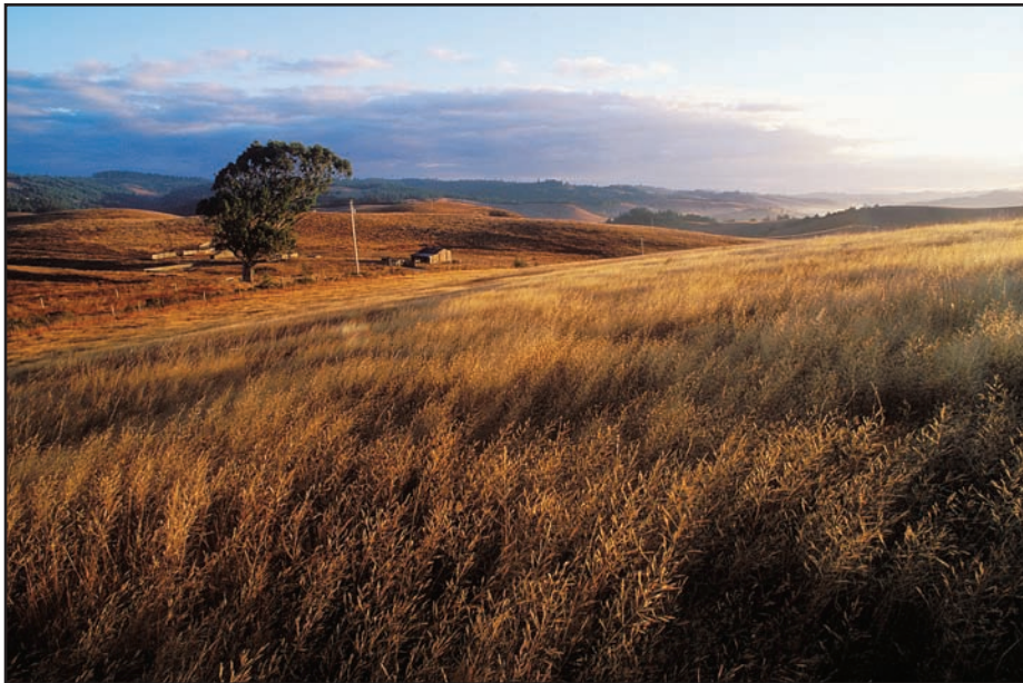
Coastal prairie is one of the most threatened ecosystems in the United States. Jerry Dodrill

View Sheds. The country roads of western Sonoma County provide some of the most delightful scenery in California. Tourists and residents alike cherish the open pastoral panoramas, ocean views, rolling hills, and driving roads through redwood and coastal oak forests. Over two million visitors travel up the Sonoma Coast each year. Lands targeted for attention include those adjacent to or visible from Highway 12 between Sebastopol and the Coast Road, Highway 1, Coleman Valley Road, Bay Hill Road, Salmon Creek Road, Joy Road and Bohemian Highway. BLT volunteers are actively photo-documenting the spectacular scenery.