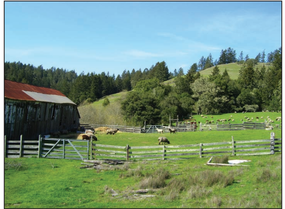
Historic barn on land currently in the process of receiving an agricultural easement. Joe Mortenson

Agriculture. Agriculture is an integral part of the western Sonoma County landscape and economy. Generations of ranchers and growers have raised sheep, dairy and beef cattle, goats, grapes and other crops. Terrain, infrastructure and soil are well suited for agriculture. Corporate farming, estate taxes, regulations and development pressure make it difficult for agricultural families to stay in business or to maintain agricultural uses of land when landowners pass away. At the same time, Sonoma County residents are placing increasing value on sustainable agriculture and eating locally grown food. Bodega Land Trust helps sustain the local agricultural community by encouraging agricultural easements. We also provide landowners with assistance and referrals to expert resources regarding best management practices and environmental restoration.