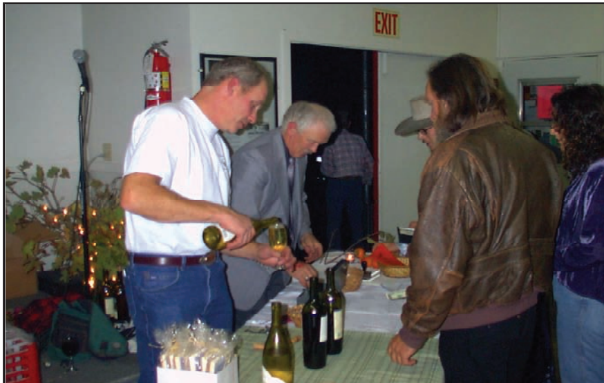
The Annual Auction is one of the mainstays of BLT fundraising.