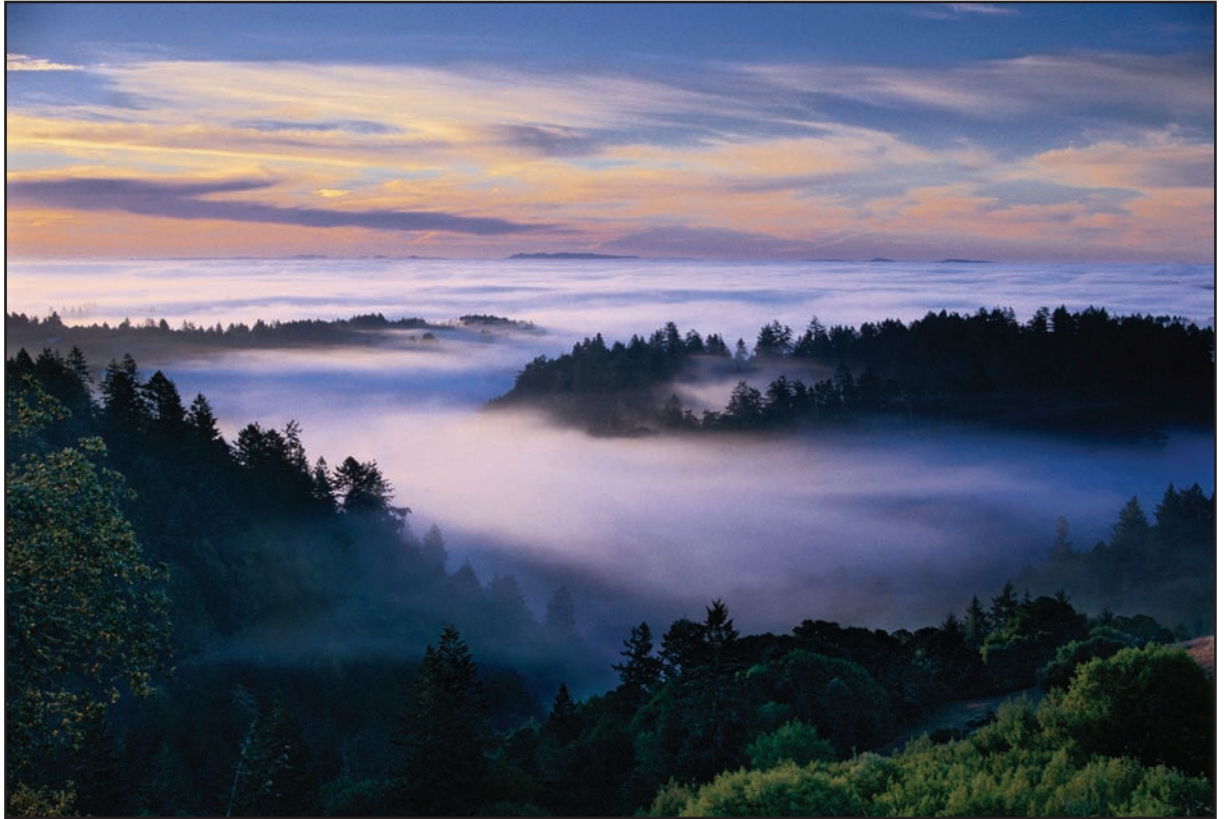
Finley Creek sub watershed looking south from Coleman Valley Road. Jerry Dodrill

Western Sonoma County is resplendent with the scenic beauty of rolling pastoral landscapes and sweeping ocean panoramas. Coastal prairie, forested hills and clear running creeks abound in this rural agricultural area. Our coastal watersheds provide important habitat for threatened and endangered species and an incredible biodiversity of plants and animals. We work to ensure that future generations can enjoy these treasures.