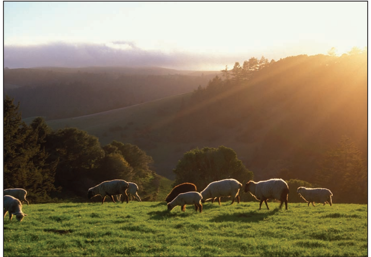
Sheep grazing the rolling hills northwest of Bodega are managed to preserve the Coastal Prairie habitat.

Cover photo: Sunrise on Bay Hill Road.