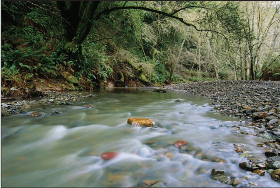
The Fay Creek easement protects some of the best steelhead spawning grounds in the Salmon Creek Watershed. Jerry Dodrill

Riparian and Watershed Values. Coastal watersheds in western Sonoma County support a variety of endangered and threatened species such as steelhead trout, California freshwater shrimp and red-legged frogs. Known causes for the threatened demise of these and historically known populations of Coho salmon include habitat degradation and decreasing summer time flow in the creeks and tributaries. The Bodega Land Trust seeks to restore ecosystem balance by targeting riparian corridors and aquifer recharge areas for protection. We work with local watershed councils and agencies to develop and implement watershed plans that protect and restore riparian habitat, monitor and improve water quality, and restore or protect instream flow. Appropriate forest and grasslands management is encouraged.